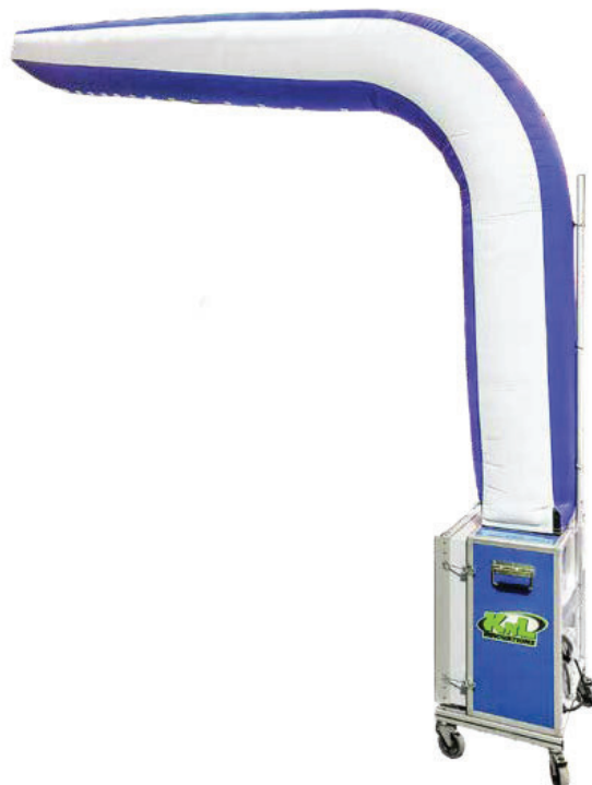
BODY SHOP BS-30